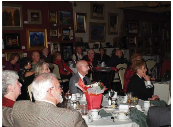
More Christmas party revelry - 2011